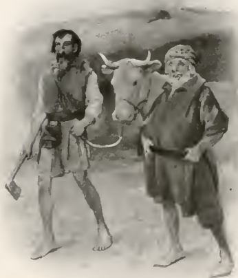
Over the boggy ground they went.

The thunderstorm had increased in violence, and by the time Will was firmly fastened into the cow's hide it was so dark that the two friends could no longer see each other and bade each other farewell in total darkness.